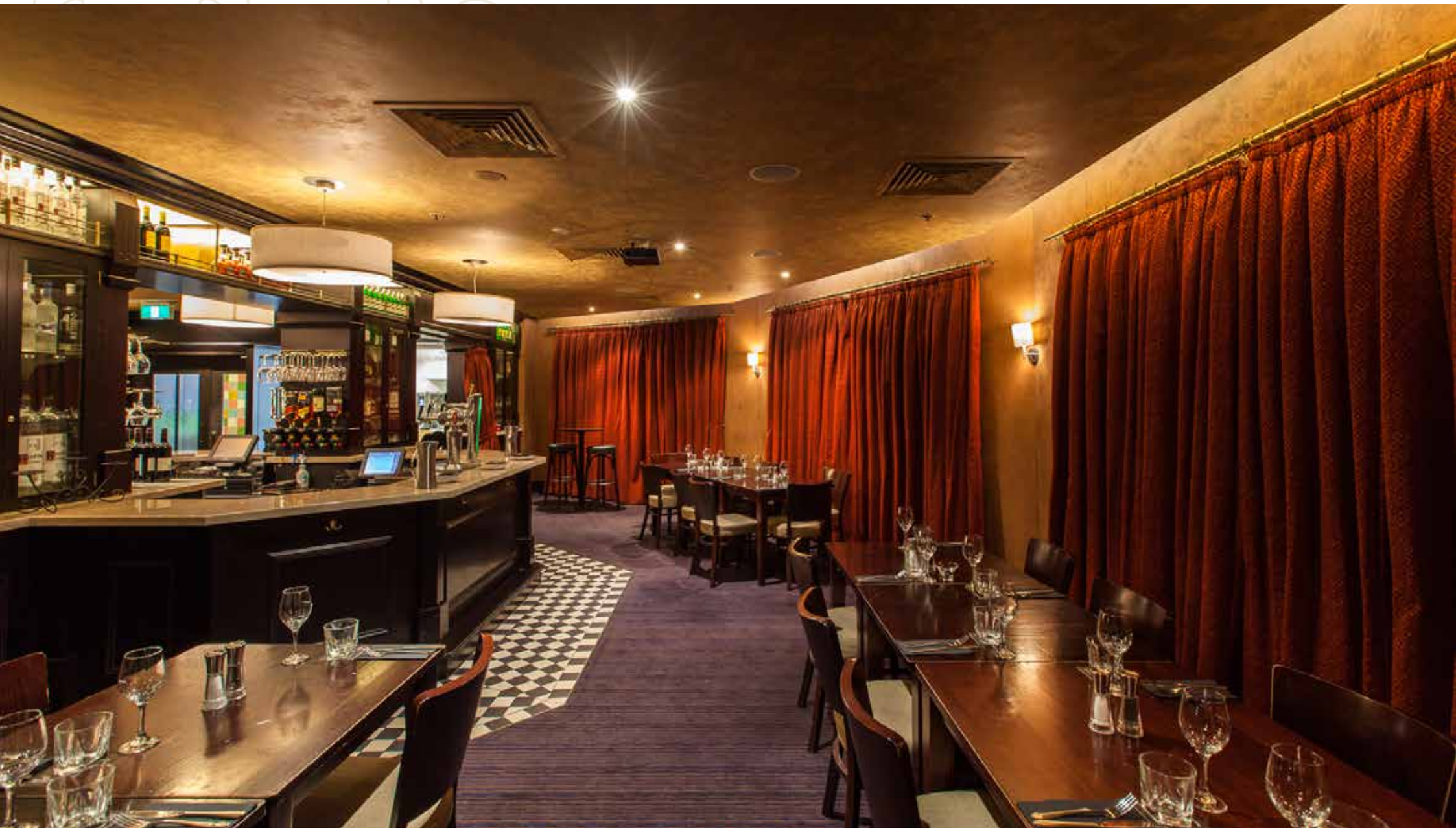
THE UPPER LOUNGE